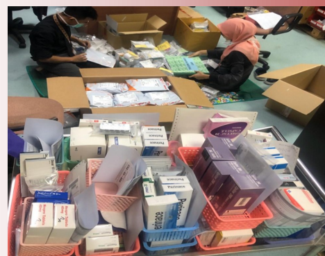
Medications packed for Drive – Thru and Postal Service